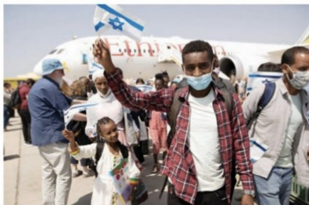
A young man waves the Israeli flag