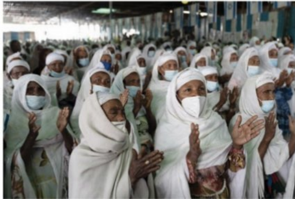
Women singing at services