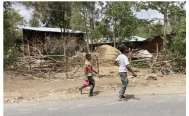
A street in Gondar, Ethiopia