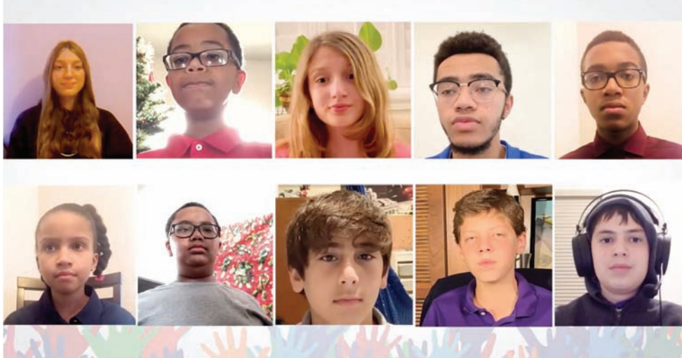
Community Celebrates Legacy on page 2