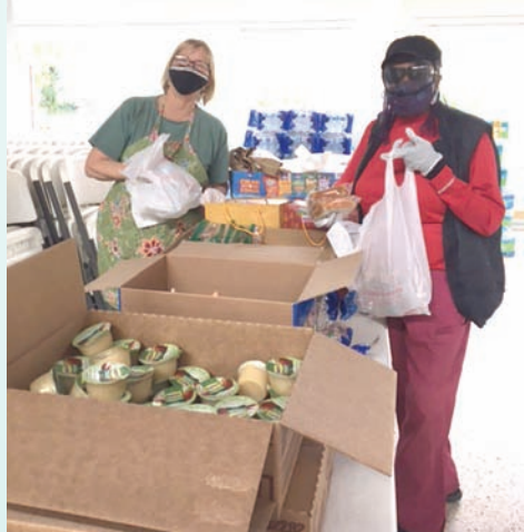
Volunteers add toiletries and snacks to the bags Temple Beth Am provides.

St. George’s Center is a refuge in Riviera Beach that provides food and a resting spot for our homeless and less fortunate neighbors.